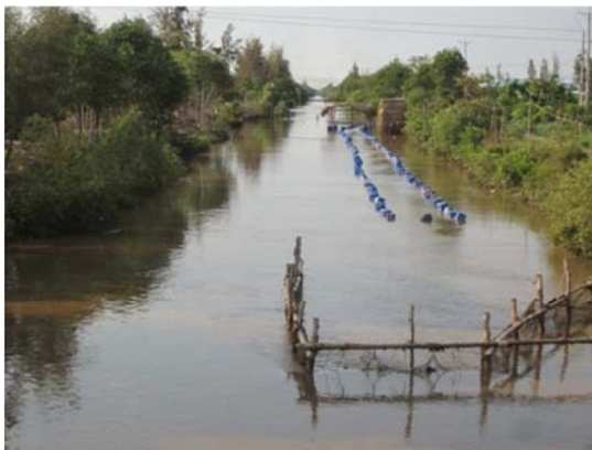
Figure 9. Models of oyster, fishes cages adapted to saltwater intrusion in the Mekong Delta, and created livelihoods for farmers (Source: KHPT Newspaper, 2011 and Nguyen Cong Thanh, 2016).