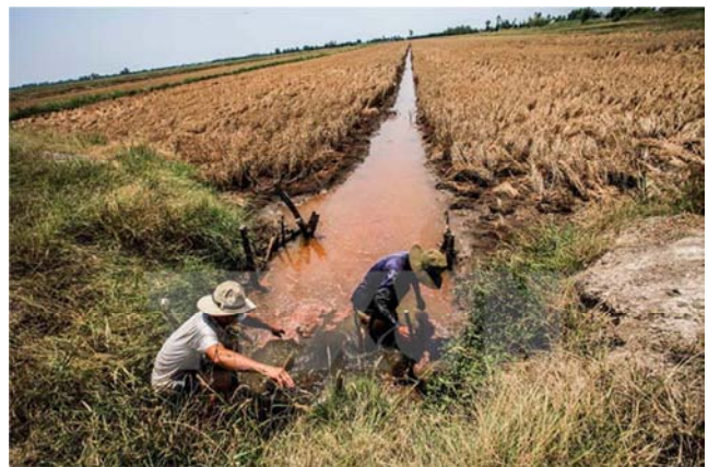
Figure 1. The irrigation canals in Hung Yen village, An Bien District, Kien Giang province affected by salinization.

MD is a downstream of the Mekong River contiguous to East Sea, in which the terrain is relatively flat and low and its two large low-lying zones are Dong Thap Muoi and Long Xuyen Quadrangle. Along with the mainstream – Tien and Hau Rivers, MD has the interlaced canals system with an average density of 4 km long in 1 km 2 , creating favorable conditions for tidal sea saltwater intrusion into fresh water rivers and internal fields, particularly in the dry season, when the water flow from upstream Mekong is lower.