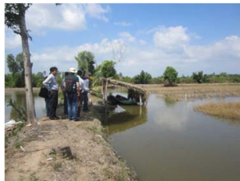
Figure 4. A rice field in Kien Giang province totally losts by salinity.

duration varieties. One rice crop is applying in salinity zone or flooding zone, where they can grow one rice crop per year. In order to diminish the effect of climate change, Vietnam government stimulate the shifting from double rice/triple rice to rice-upland crops rotation. However, the most difficult is the market for the products of upland crops.