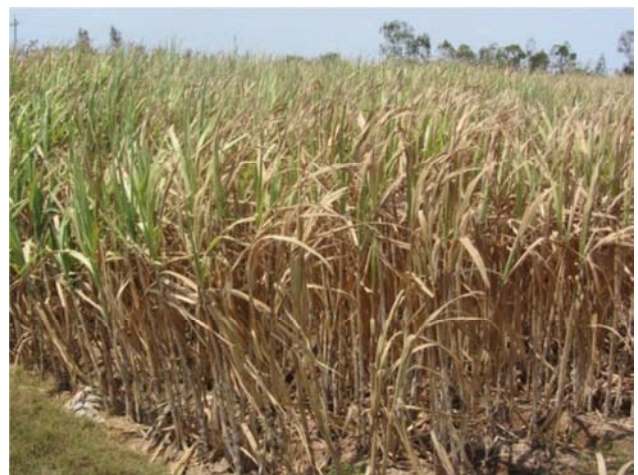
Figure 7. A sugarcane field in Soc Trang province affected by salinity.

In India, the report from CDKN Asia (Climate & Knowledge Development Network) wrote that what are the adaptation and mitigation strategies? We need crops and varieties that fit into new cropping systems and seasons. We need to develop varieties with changed duration and varieties tolerant to high temperature, drought, inland salinity and submergence. We also need crops and varieties that tolerate coastal salinity and seawater inundation and varieties which respond to environment with high CO 2 . Lastly, we need varieties with high efficient utilization of fertiliser and radiation [9].