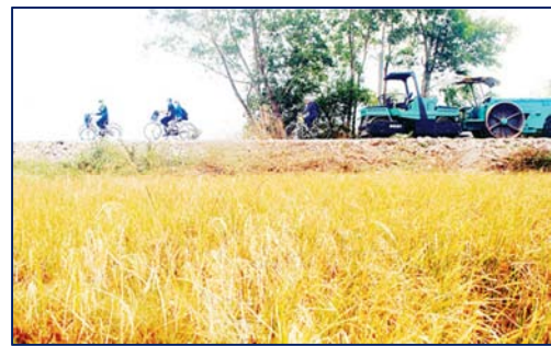
Figure 3. Many fields in the Ca Mau province withered as drought and salinity.

currently the most severely affected by drought, saltwater intrusion, and continues to be affected in the future. In the year 2016, the highest saltwater intrusion was between March, 2016.